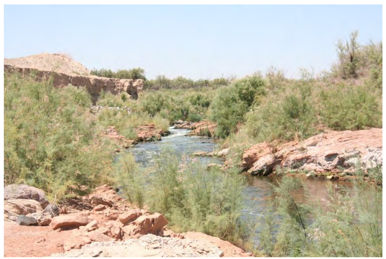
Figure 2: Conditions of Lower Narrows Weir prior to construction

Prior to construction, the footprint of activity where the Lower Narrows and Homestead Weirs are currently was dominated by salt cedar ( Tamarix ramosissima ; Figure 2). This included wetland and riparian areas as well as non-wetland areas. The location where wetland and riparian vegetation existed prior to construction was completely removed and replaced with a new channel. Non-wetland areas which included salt cedar also included areas with substantial saltbush populations were altered near the channel. However the only significant change was the removal of all vegetation prior to construction commencing.